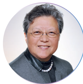
范徐麗泰博士 DR. RITA FAN