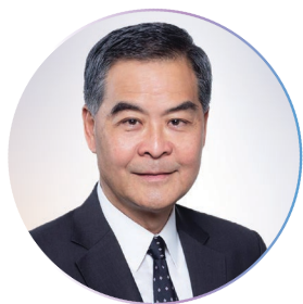
梁振英博士 DR. CY LEUNG