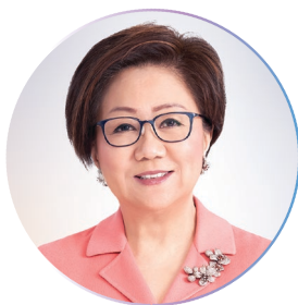
史美倫女士 MRS. LAURA CHA