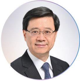
李家超 JOHN KC LEE

中華人民共和國香港特別行政區行政長官 Chief Executive of the Hong Kong Special Administrative Region of the People's Republic of China