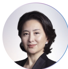
何超瓊女士 MS. PANSY HO