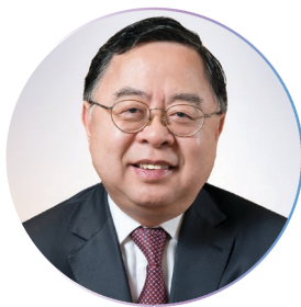
陳啟宗先生 MR. RONNIE C. CHAN