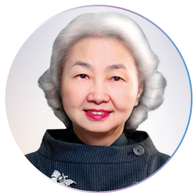
梁愛詩博士 DR. ELSIE LEUNG