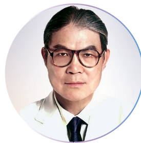
霍震霆先生 MR. TIMOTHY FOK TSUN-TING